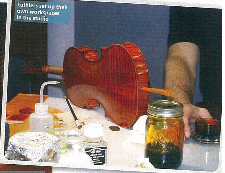
Luthiers set up their own workspaces in the studio