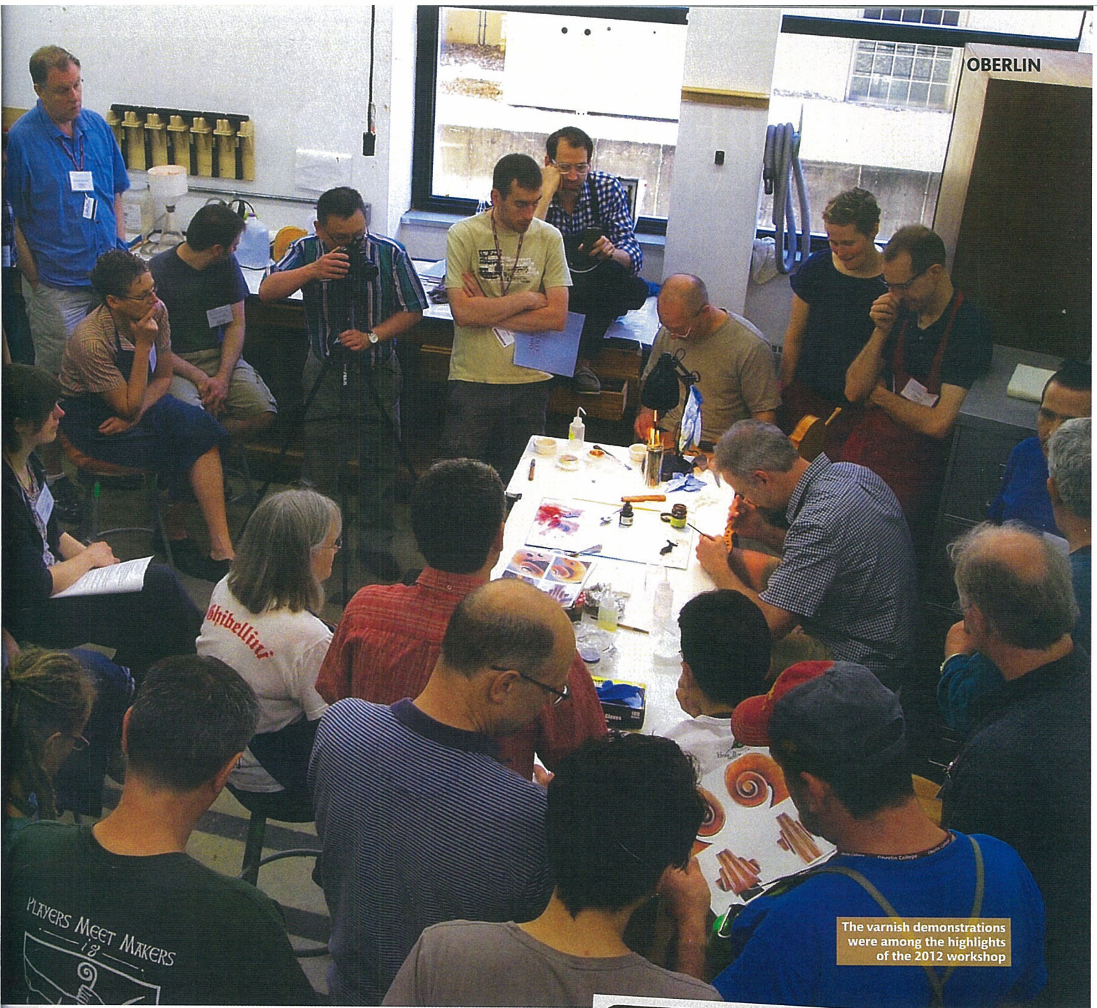
The varnish demonstrations were among the highlights of the 2012 workshop